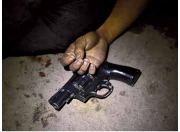
The police are accused of planting guns on the victims