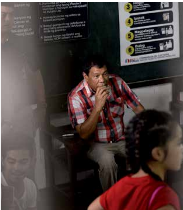
left: President Rodrigo Duterte