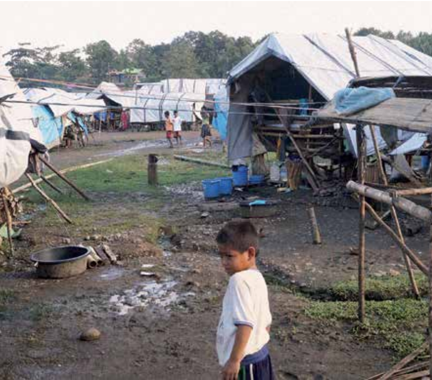
Displaced indigenous communities in Tandag City

In 2015, there were mounting reports of human rights violations committed against members of the indigenous communities of the Lumads living on Mindanao island in the south of the Philippines. Lumad is a collective term used to denote the members of various indigenous, non-Muslim groups in Mindanao. Mass migration of Christian settlers once displaced these groups to the remote, inhospitable Mindanao mountain regions. Today, the Lumads are among the poorest populations of the Philippines.