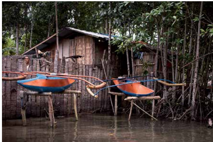
top: Traditional fisher boats on Samal Island

In addition, there have been increasing reports of human rights violations committed against indigenous communities and particularly against the Lumads on Mindanao Island in the south of the Philippines. The indigenous Lumads are especially vulnerable to being caught in the crossfire of the domestic conflict between the Philippine government and the communist insurgency of the NPA. The military and paramilitary systematically suspect independent indigenous schools of serving the NPA as training camps and persecute them for this reason. Planned mining projects and large-scale plantations in indigenous regions are a further reason for displacement. These environments offer paramilitary groups the opportunity to pursue their own economic interests unimpeded under the guise of fighting insurgency.